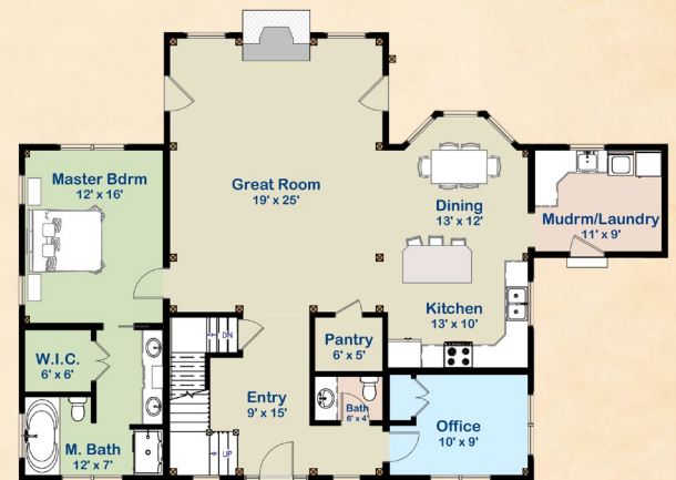
First Floor - 1658 sq. ft.